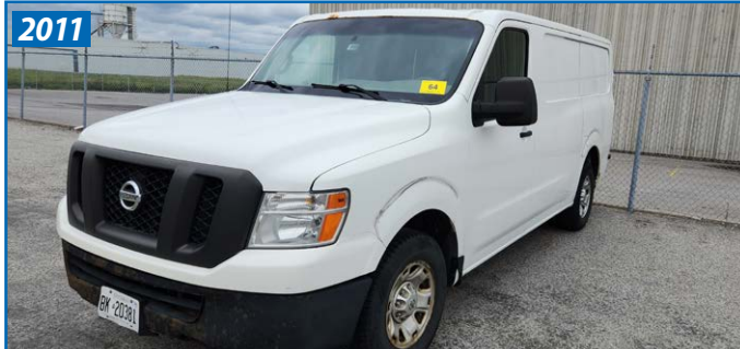
NISSAN NV3500HD CARGO VAN

PLUS: CRAFTEX Dust Collectors, RIDGID, DEWALT, MAKITA, RYOBI, PORTER CABLE, BOSCH Power Tools, End Mills, Cutting Tools, Table Saws, Overhead Router, Free Standing Jib, Air Compressors, Paint Spray Booths, Commercial Kitchen Equipment, BESSEY & Bar Clamps, Hardware, Wood Inventory, Edge Banding Inventory, Office Furniture & Much More!