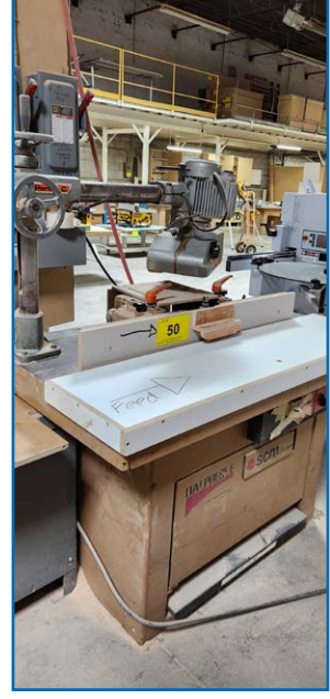
SCM T120K SHAPER