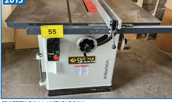
BLUM MINIPRESS P CRAFTEX CX206 12"TABLE SAW