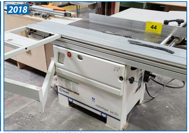
SCM MINIMAX SC2C SLIDING TABLE SAW