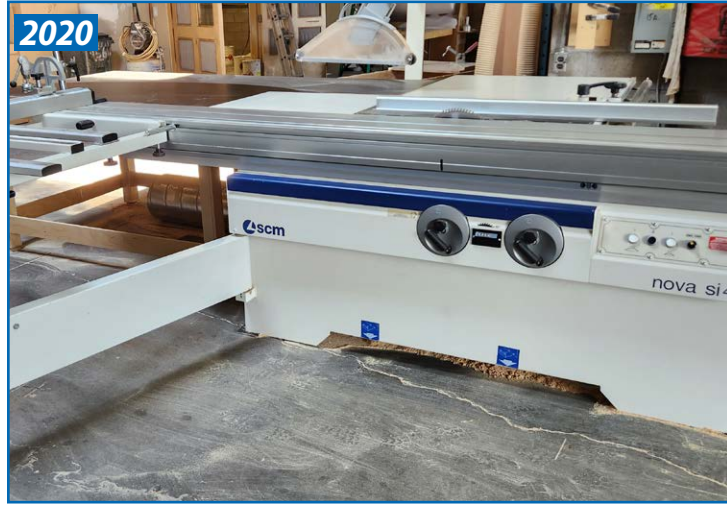
SCM NOVA SI400 SLIDING TABLE SAW