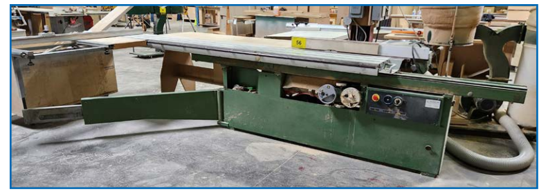
MACCHINE CASADEI KS/3200 SLIDING TABLE SAW